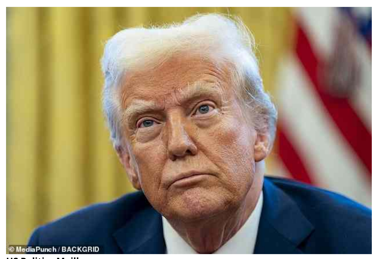
US Politics Mailbox Get all the biggest stories from Trump's historic second administration straight to your inbox